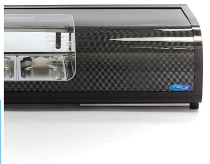
Dixell digital temperature controller