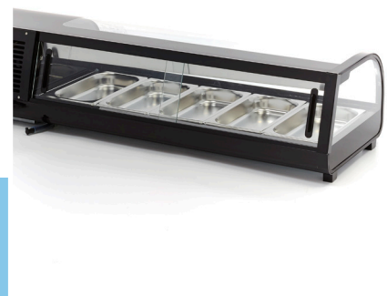
Stainless steel housing & inside