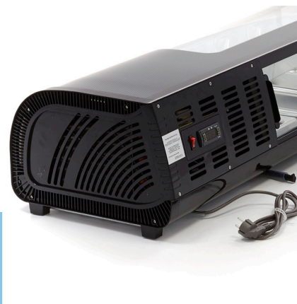
Cooling system with fan